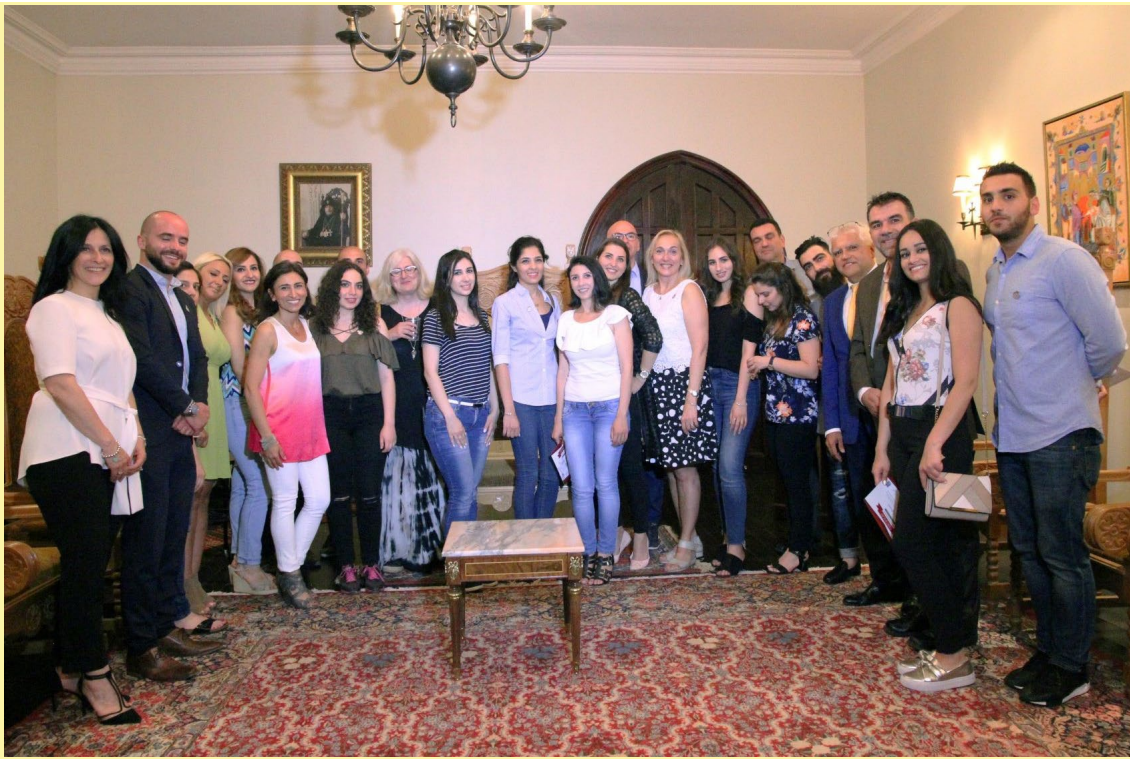
RBC & Hay Doun management with AJF-assisted vocational program participants