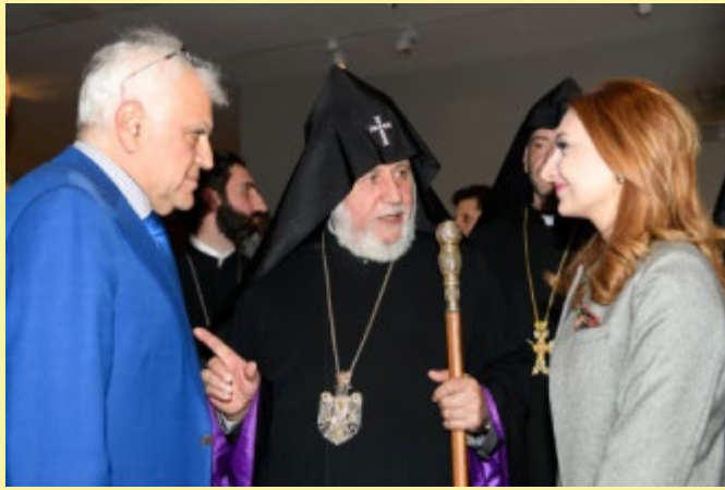
H.H. Catholicos Karekin II & Minister of Culture Lilit Makunts