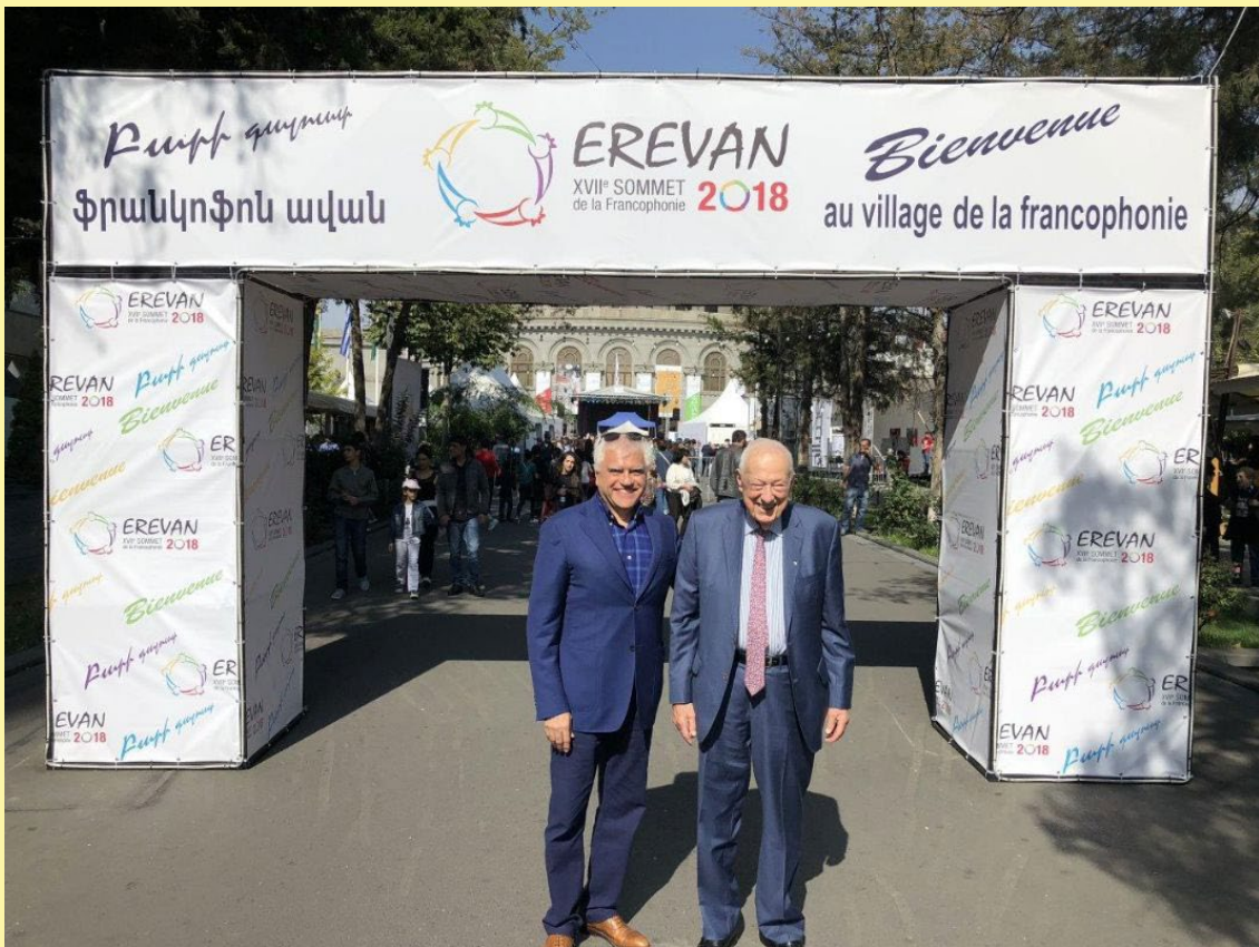
Canadian Senator & AJF Patron Honourable Raymond Setlakwe